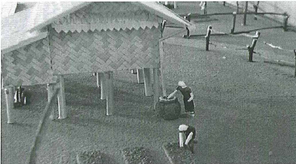
Figure1 – Model of RWH System in Schools in Lao PDR